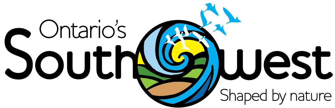
Horizontal Version (Preferred)