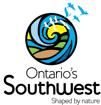
Vertical Version (Optional)